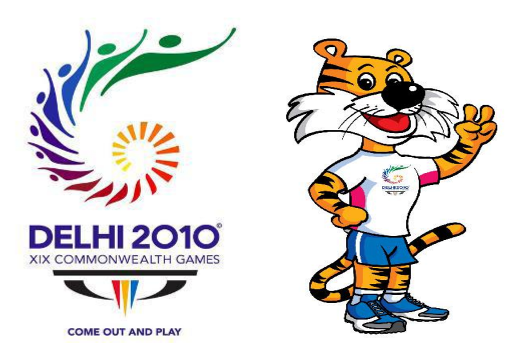
CWG Logo for 2010 Games along with the Mascot "Shera"

The XIX Commonwealth Games were held in New Delhi from 03<sup>rd</sup> to 14<sup>th</sup> October 2010. This was the first time that the Commonwealth Games were being hosted in India and only the second occasion when the Games were being hosted by an Asian country, the first being Malaysia in the year 1998. The event saw a total of 6,081 athletes from 71 Commonwealth nations and dependencies competing against each other in 21 sports and 272 events.